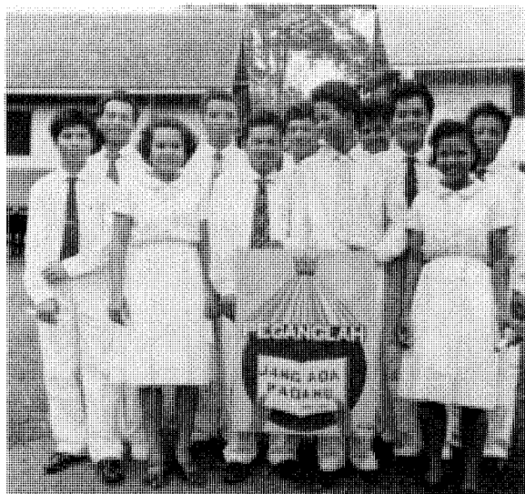
Bible School Graduates now in full time service.

Darit, Ngabang, Kalimantan Barat, Indonesia.