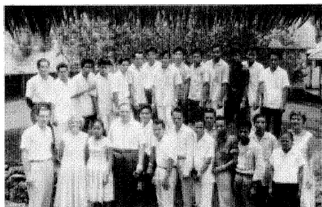
Easter Conference of Full time workers.