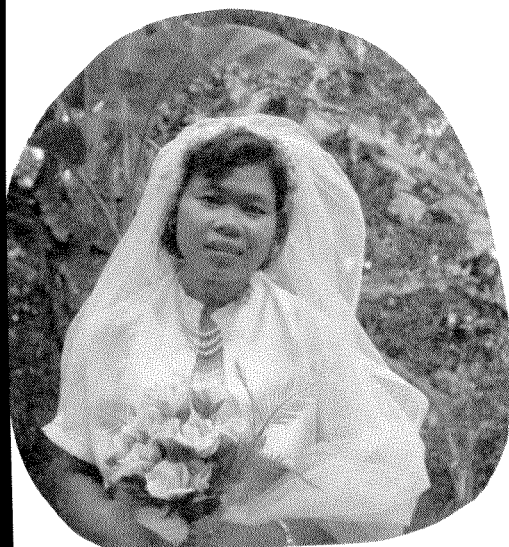
Graduate now a pastor's wife.