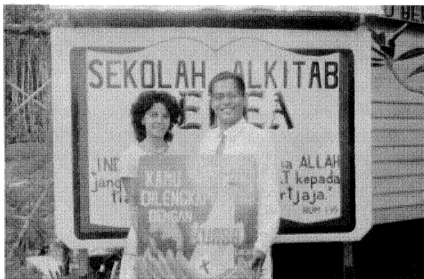
1965 graduate now on Bible School staff.